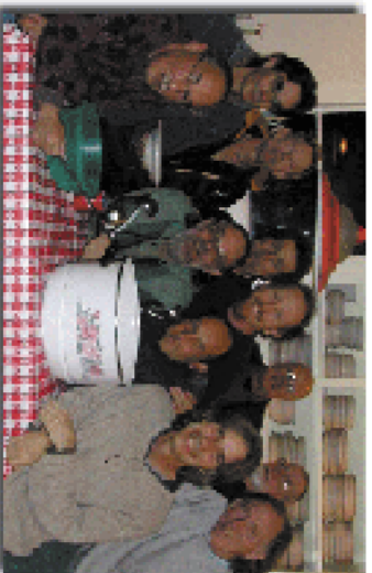
"Visions of turkeys danced in their heads!"

DUES - Dear Brothers, if you have not paid your dues for 04 please do so now. Thanks